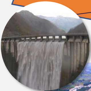
Dams & Reservoirs